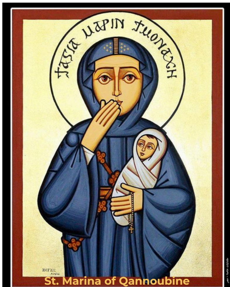
أيقونة القديسة مارينا الراهبة