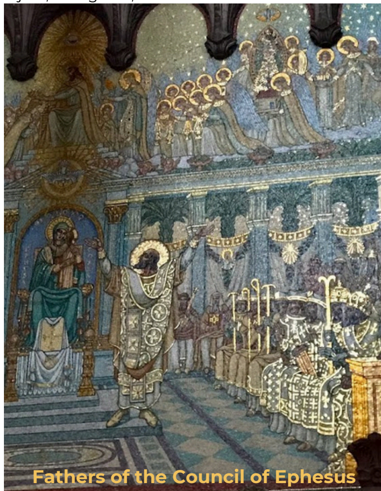
Fathers of the Council of Ephesus